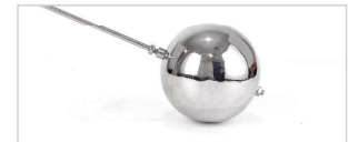
聚氨酯球 PU BALL