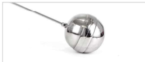
不锈钢球 STAINLESS STEEL BALL