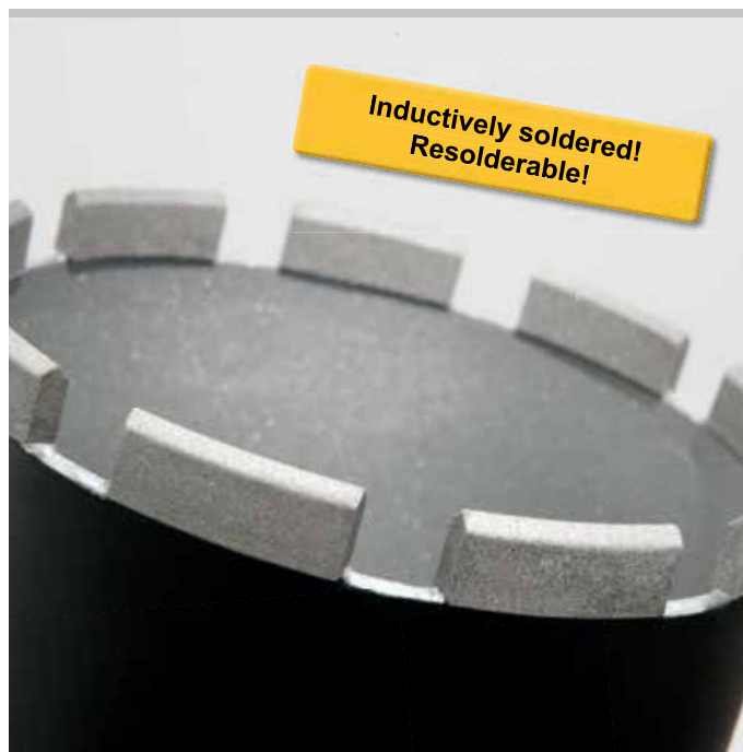
German Quality Product

Drive through all REMS Picus drive machines and suitable drive machines of other makes having connecting thread UNC 1 ¼ male. Adapter for using REMS Universal diamond core drilling crowns in drive machines having other connecting threads, as accessory.